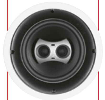
"e" – New 8.3e with trim ring and bow-tie tweeter