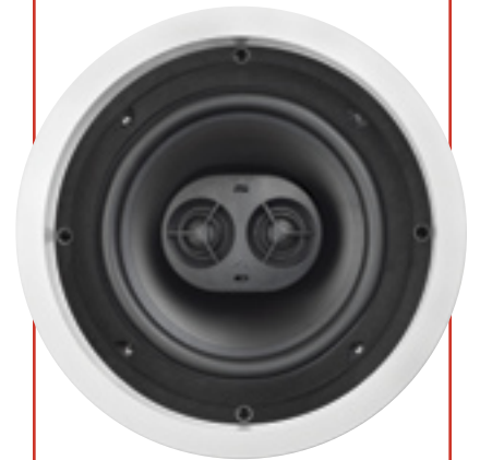
Non "e" – Original 8.3