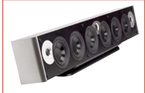
Figure 1: Atlantic 3-in-1 Speaker