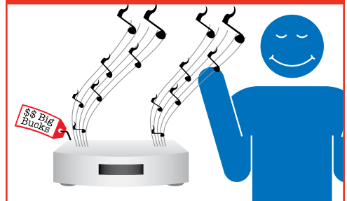
Figure 2: High-Quality FM Table Radio

Rich tone is more important than stereo separation