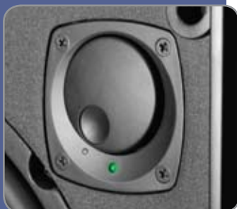
224, 334, 444 SB Front Panel Level Control