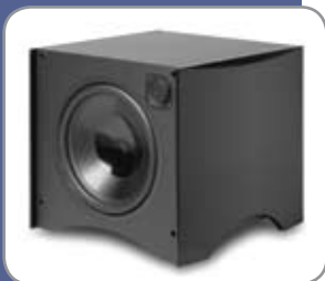
224 SB in Satin Black