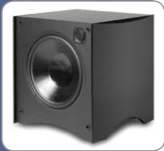
444 SB in Satin Black