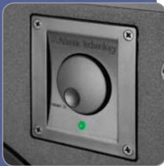
642e SB Front Panel Level Control