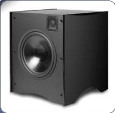
642e SB in Gloss Black