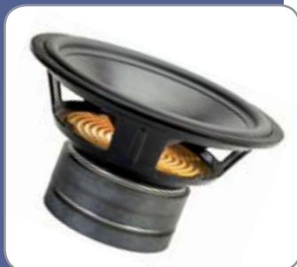
642e's Powerhouse 12" Driver

Atlantic Technology is a registered trademark and Clear Filter Technology is a trademark of Atlantic Technology International. THX and THX Select are registered trademarks of THX. Specifications subject to change without notice.