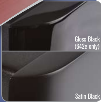
Gloss Black (642e only)