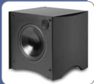
334 SB in Satin Black