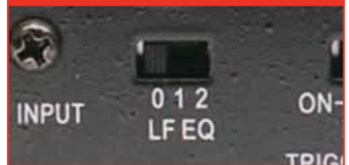
Try all three LFEQ settings to get the best balance.