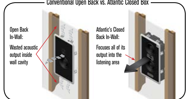
Conventional Open Back vs. Atlantic Closed Box