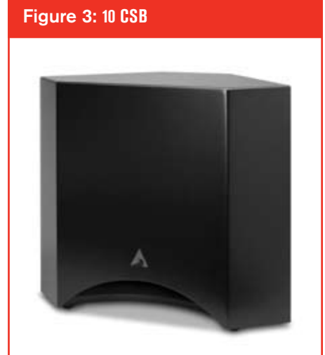
10 CSB Corner Subwoofer is the only exception to the rule