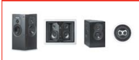
...all our surrounds work with all our LCRs.