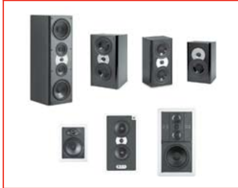
All our Left/Rights...