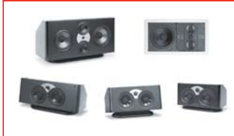
...work with all our centers, and...