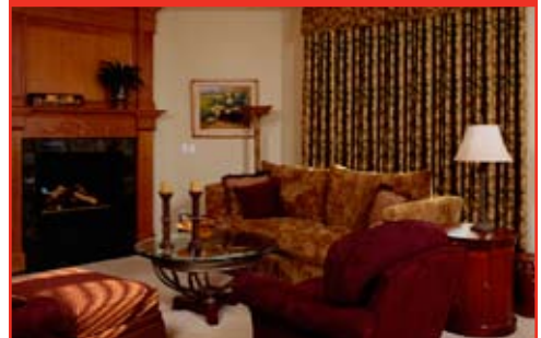
Dead Room absorbs too much sound