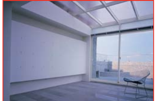
Too many reflective surfaces